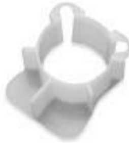
Part No. 49-2665 MS27242-1