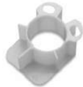
Part No. 49-2667 MS27243-3