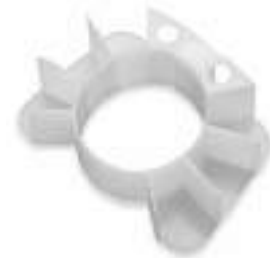
Part No. 49-2670 MS27243-4