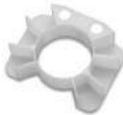
Part No. 49-2661 MS27243-1